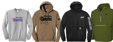
1 and 2 3 4 5