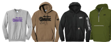
1 and 2 3 4 5