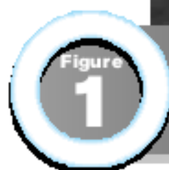
Urea Vs. Biuret — Urea gained 45% water vs. biuret that gained 9% water, after 48 hours in a humidity chamber.