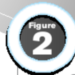
The unique chemistry means that biuret is still contributing to rumen ammonia even more than a day after its consumption.

that ration ingredients and other dietary conditions do not affect the ammonia-release characteristics of biuret. Biuret's ammonia-release pattern (see Figure 3) is close to that of vegetable proteins; however, biuret sustains ammonia release for many more hours than vegetable proteins or coated-ureas. This means biuret is still contributing to rumen ammonia even more than a day after its consumption.